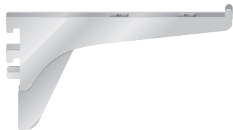
185 Series Double-Flange Adjustable Bracket